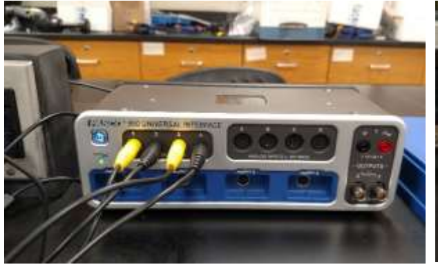
Connections for two old motion sensors.