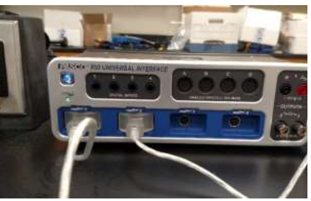
Connections for two new motion sensors.